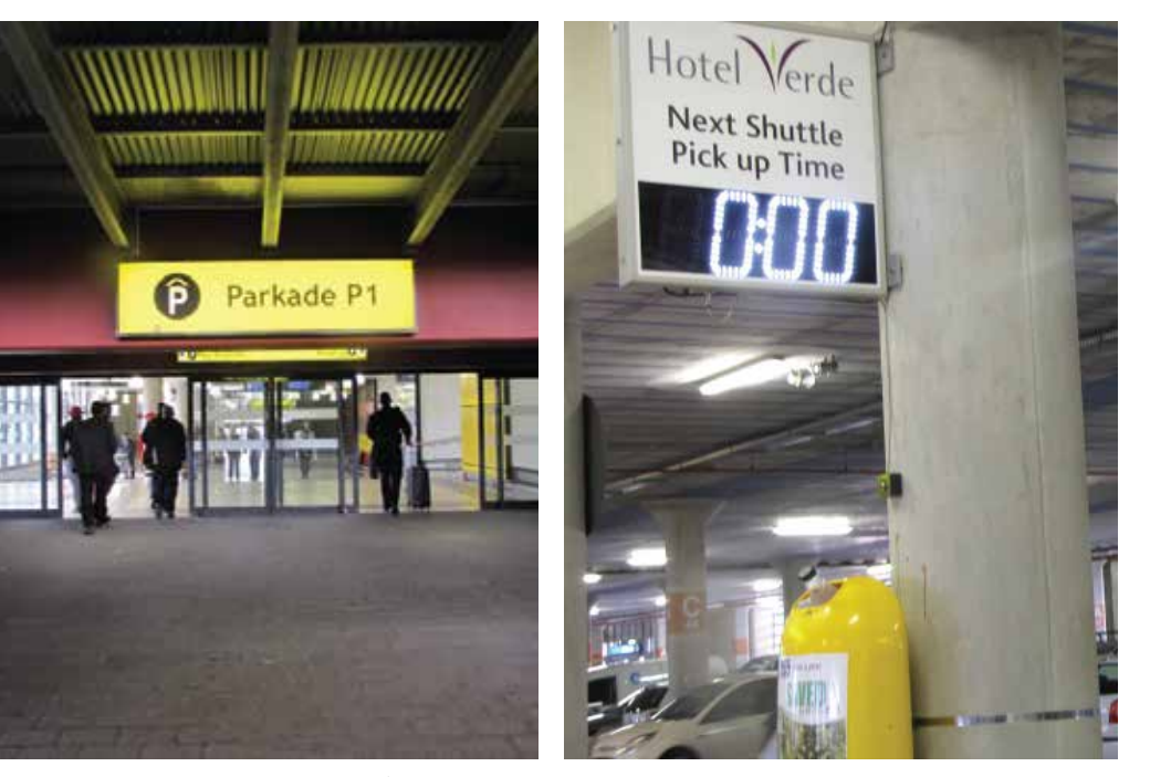
You're almost there! Keep following the signage. Enter Parkade 1, walk down the slope and turn right into the corridor. Look out for the Hotel Verde clock where our driver will pick you up.