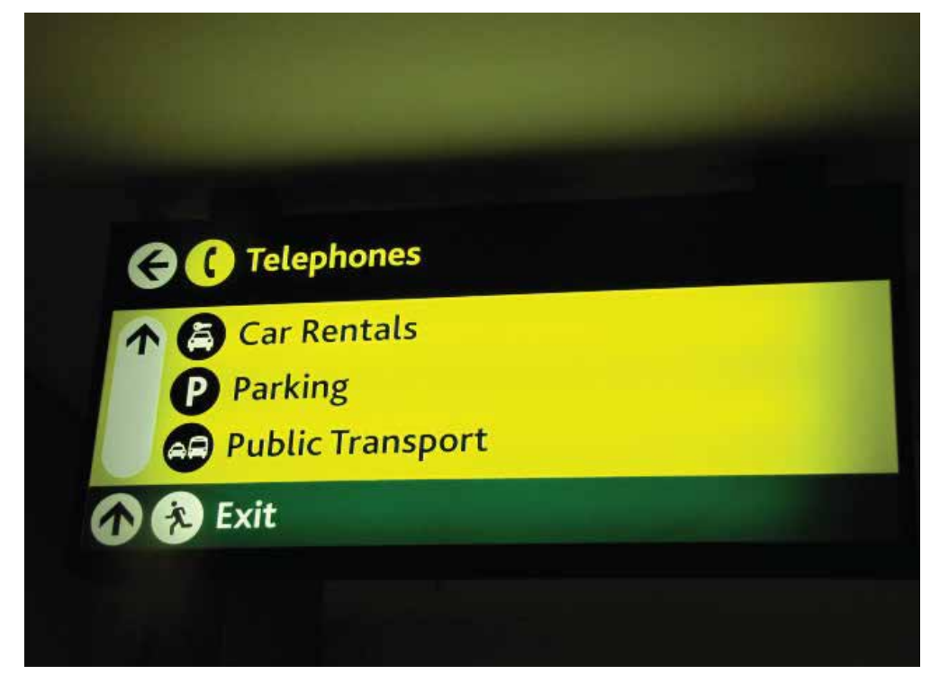
Follow the yellow directional signage towards Parkade 1