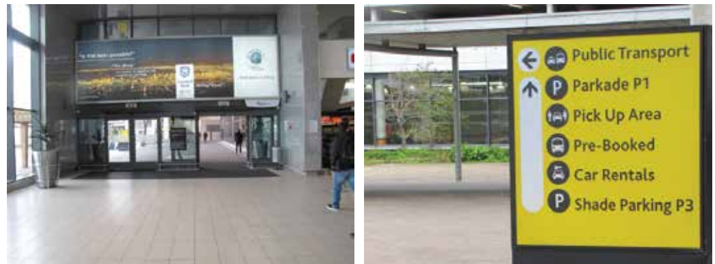
Exit out of the sliding doors in the main lobby next to CNA. Keep on following the yellow directional signage.